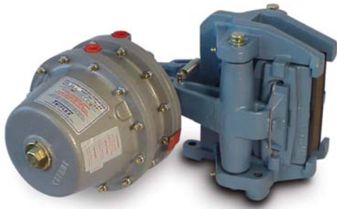
Twiflex GMR-SD Caliper Brake

Many factors influence brake wear, including: the number of stops performed; speed of the stops; proper lining adjustment and operator performance. Wear on multi-disc brakes tends to occur in the friction material on the disc assemblies. If high-speed stops have been frequent or the wear adjustment has not been properly maintained, this can result in wear and heat checking of the opposing iron plates.