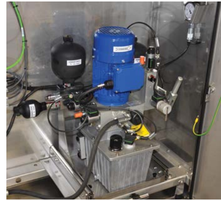
All Svendborg power units are designed and manufactured in-house to ensure compatibility with other Svendborg braking system components. Units are equipped to monitor oil level and temperature, motor and pump function, and system pressure.

One other money-saving recommendation that may be considered is brake type standardization. While it might cost slightly more initially to specify the same brake models on two different conveyors within a facility, there may be significant savings achieved through standardization of parts and by making it easier for maintenance teams to become familiar with only one brake type.