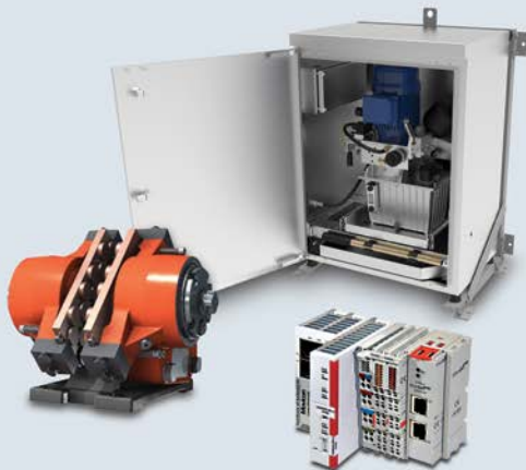
The braking system, consisting of eight model BSFI 320 caliper disc brakes, a SOBO iQ controller and two hydraulic power units.