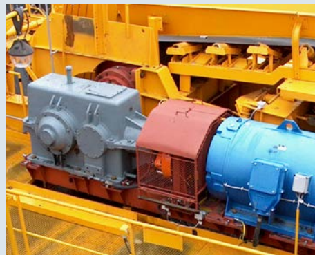
Spring-applied, hydraulically-released BSFI 320 brakes act on a 0.8 m (2.6 ft.) diameter disc mounted between the electric drive motor and the gearbox on the high-speed side of the drive. The brake system can provide 60 kNm of torque max. and allow for controlled braking up to 50-seconds in case of a power failure.