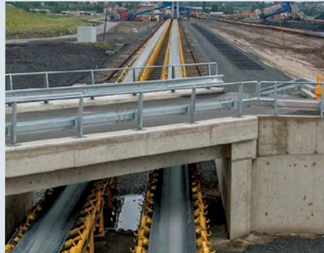
A 900 m (.55 mile) long overland conveyor, powered by three 500kW drives, installed at a large coal mine in Tusimice, Czech Republic.

The spring-applied, hydraulically-released BSFI 320 brakes act on a 0.8 m (2.6 ft.) diameter disc mounted on the high-speed side of the drive. The brake system can provide 60 kNm of torque max. and allow for controlled braking up to 50-seconds in case of a power failure.