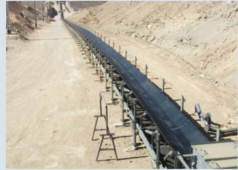
A large copper mine in Chile utilizes a series of three downhill in-line conveyors. Two of the conveyors are 1600 m (1 mile) long and the third is 700 m (.4 mile) long. The conveyors can transport 5,000 tonnes/hour with a belt speed of 5.5 m/s (12.3 mph).

Brake Ramp 2 is for normal braking and might be programmed for 60 seconds. Typically, the motor VFD can slow the conveyor to a couple RPMs. At that point, the braking sequence will be applied at approximately 5% to take over the final stop, and then the parking brakes will be applied to hold the conveyor in the locked, secured position when the conveyor is completely stopped.