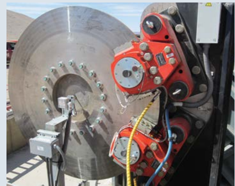
Spring-applied, hydraulically-released BSFH 520 brakes act on a 1.6 m (5.2 ft.) diameter disc mounted on the low-speed side of the drive shaft. The brake system provides up to 134,354 ft.lbs. (182,160 Nm) nominal braking torque to stop the conveyor in a controlled manner over a 50-second time period.