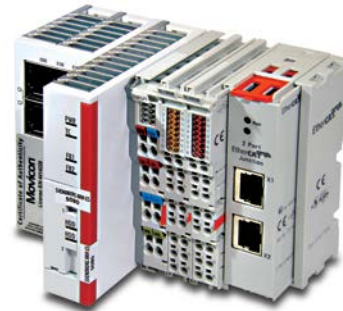
The unique SOBO iQ soft-braking controller provides a range of safety and durability benefits in mining conveyor applications.

“For example,” he said. “When you want to stop your car, you apply hard pressure to the brake pedal. When the car is almost stopped, you begin lifting your foot. We can apply the same kind of curve to the SOBO system.”